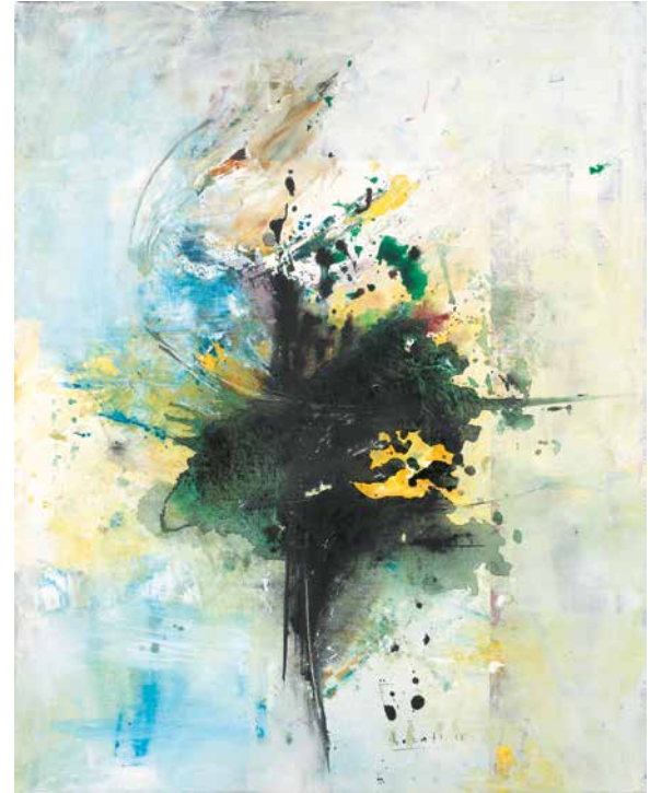
Green Storm acrylic on canvas 2015, 100 x 80 cm center right: signed and dated