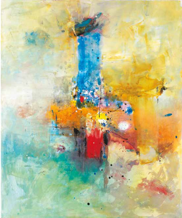
Blue Energy acrylic on canvas 2019, 120 x 100 cm center left: signed and dated