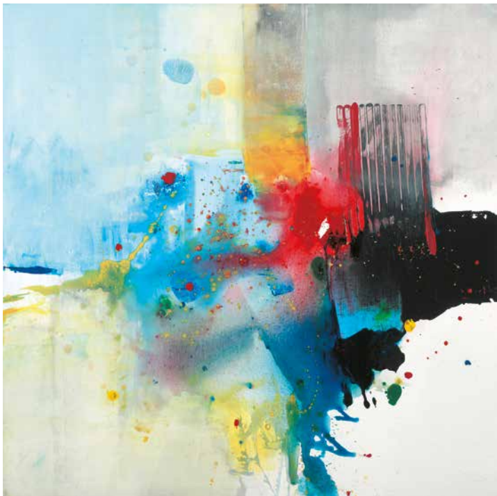
Donau City acrylic on canvas 2018, 100 x 100 cm center right: signed and dated