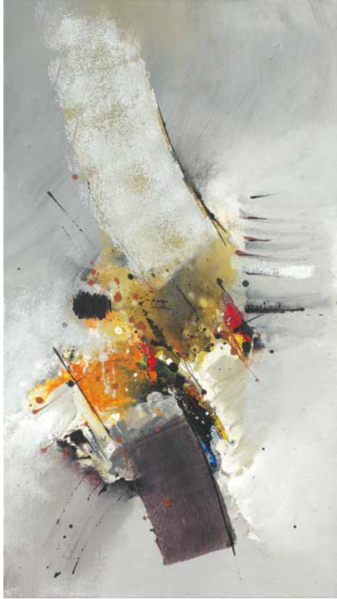
White Stripes on the Grey acrylic on jute 2018, 80 x 45 cm bottom right: signed and dated