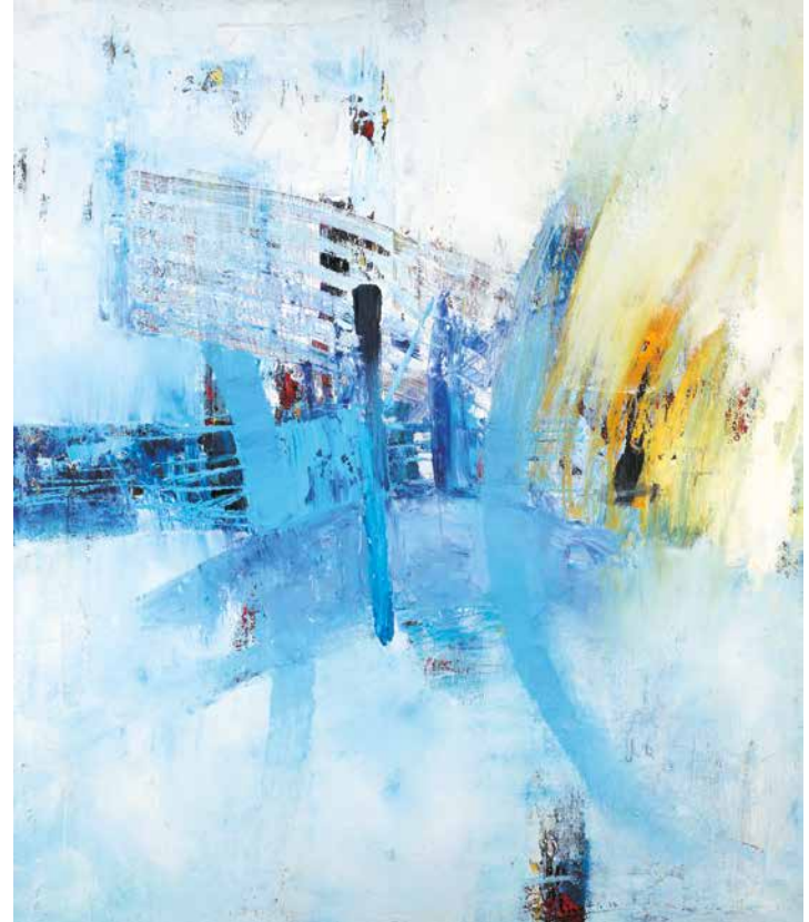
High Seas acrylic on canvas 2013, 140 x 120 cm bottom right: signed and dated