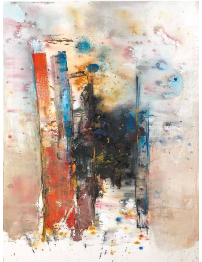
Sag Harbour acrylic on canvas 2018, 120 x 90 cm bottom left: signed and dated