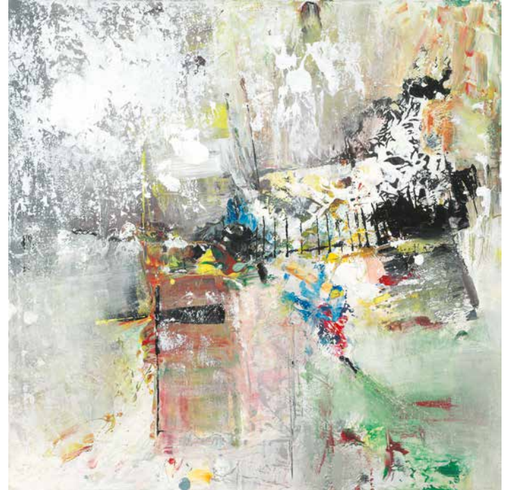
W.A.M. Schneeflockchen acrylic on canvas 2019, 90 x 90 cm center right: signed and dated