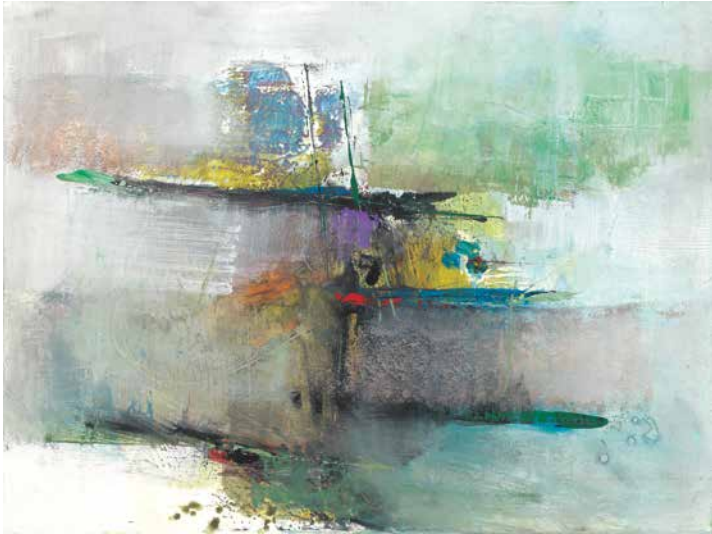
W.A.M. Requiem acrylic on canvas 2019, 60 x 80 cm bottom right: signed and dated