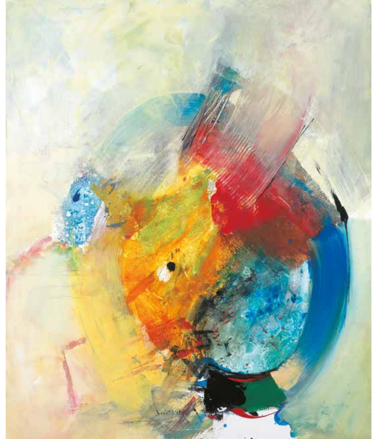
Morning Mirage acrylic on canvas 2019, 120 x 100 cm bottom center: signed and dated