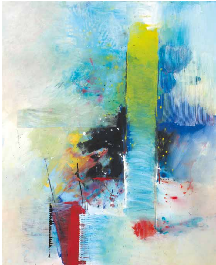
West Hampton Beach acrylic on canvas 2018, 110 x 90 cm bottom right: signed and dated