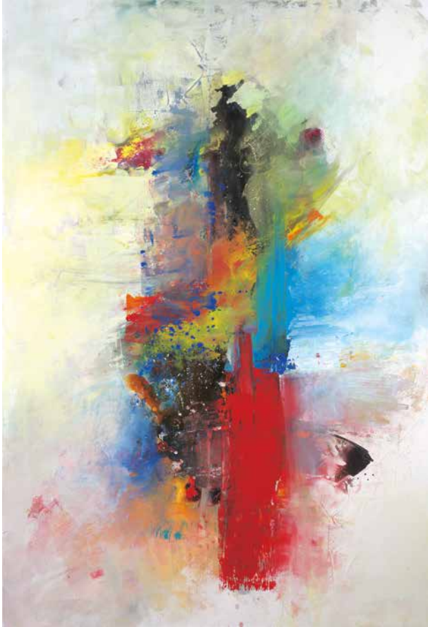
Colourful World acrylic on canvas 2019, 191,5 x 131 cm bottom center: signed and dated