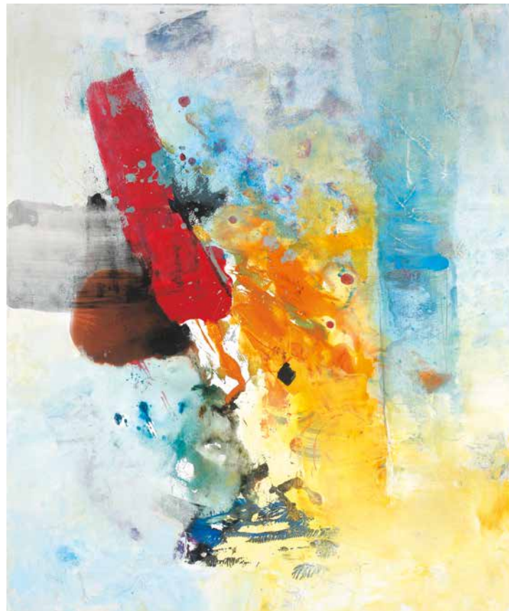
Harbour Sunset acrylic on canvas 2019, 120 x 100 cm bottom left: signed and dated