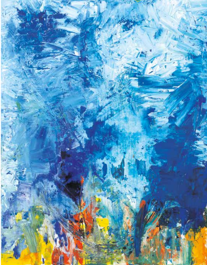
Mediterranien Blues acrylic on jute 2014, 155 x 90 cm bottom center: signed and dated