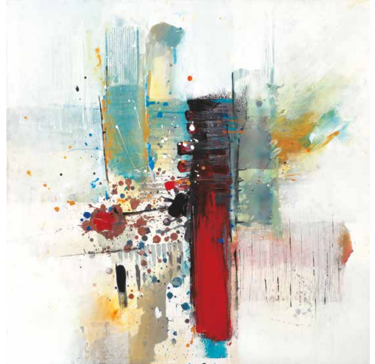
W.A.M. Symphonie 41 acrylic on canvas 2018, 100 x 100 cm center left: signed and dated