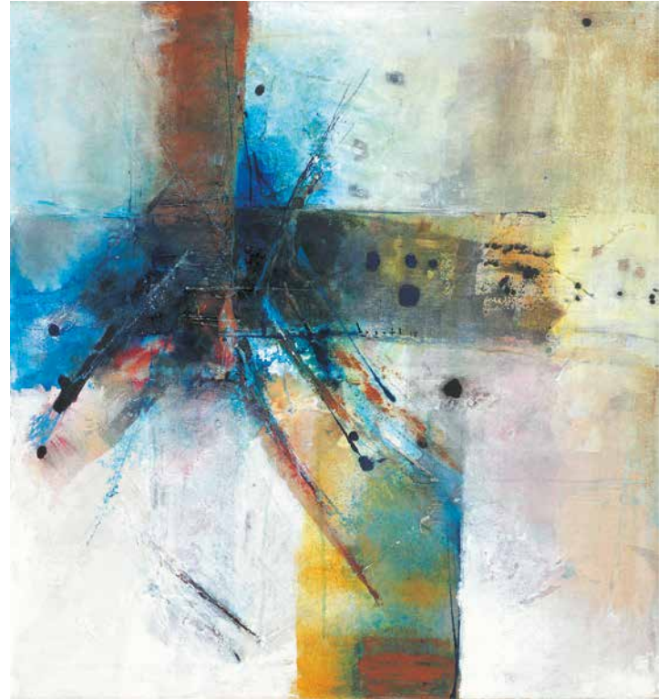
Crossing Over acrylic on canvas 2015, 75 x 70 cm center: signed and dated