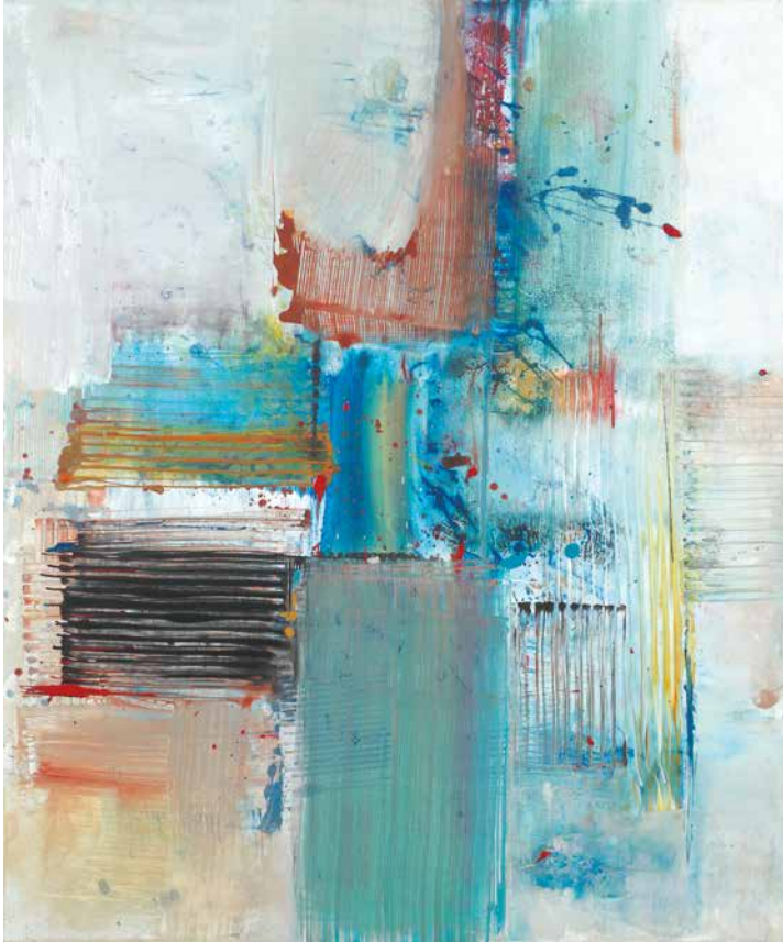
W.A.M. Symphonie 25 acrylic on canvas 2018, 120 x 100 cm center right: signed and dated