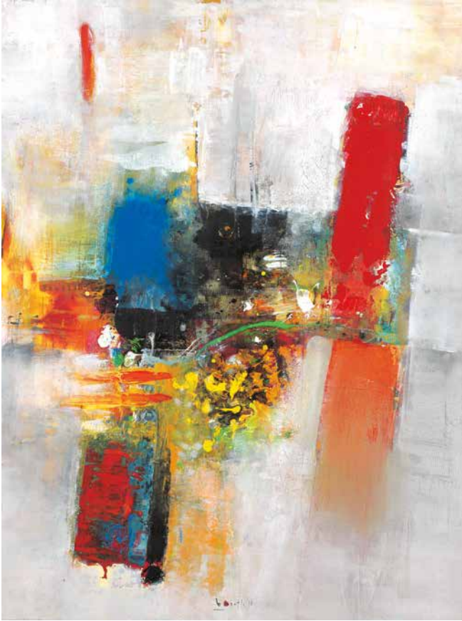
Red on the Grey acrylic on canvas 2016, 120 x 90 cm bottom center: signed and dated