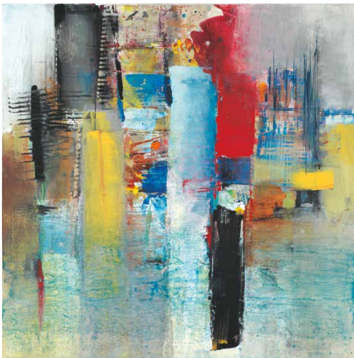
An schönen blauen Donau acrylic on canvas 2019, 100 x 100 cm center right: signed and dated