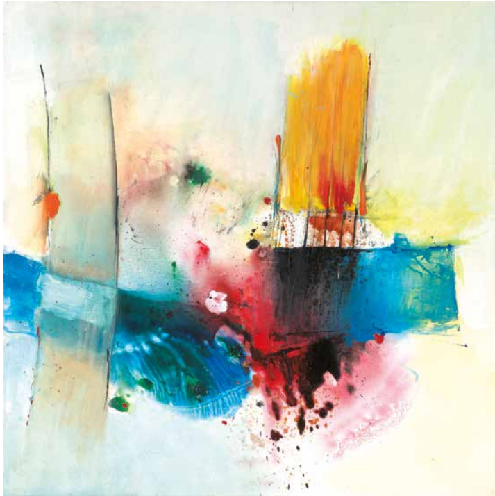
Haus des Meeres acrylic on canvas 2018, 100 x 100 cm center right: signed and dated