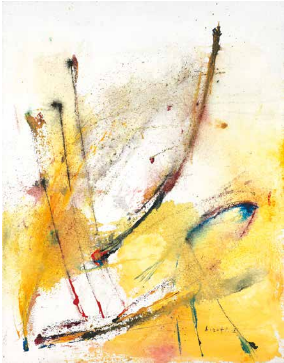
Lines and Stripes II acrylic on jute 2012, 90 x 70 cm bottom right: signed and dated