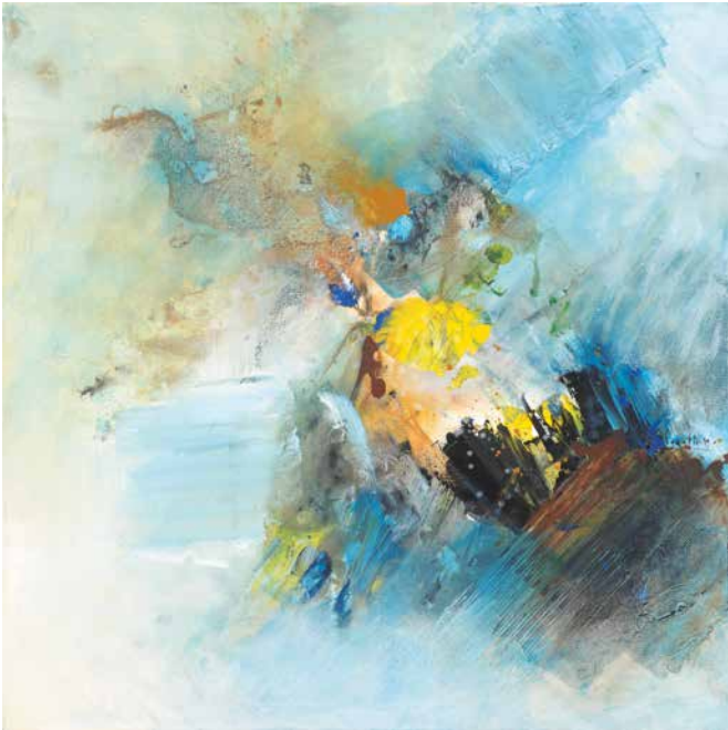
W.A.M. Violin Concert 4 Allegro acrylic on canvas 2019, 80 x 80 cm center right: signed and dated