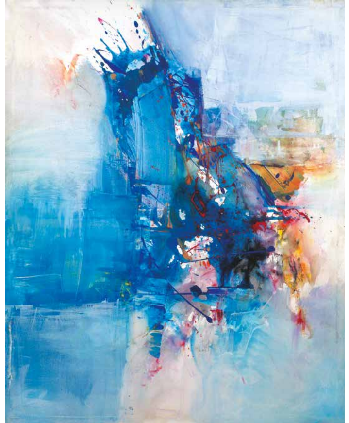
Inside Out acrylic on canvas 2019, 173,5 x 140 cm bottom center: signed and dated