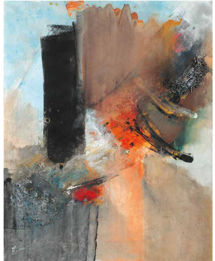
Glut acrylic on canvas 2019, 99 x 97 cm bottom left: signed and dated