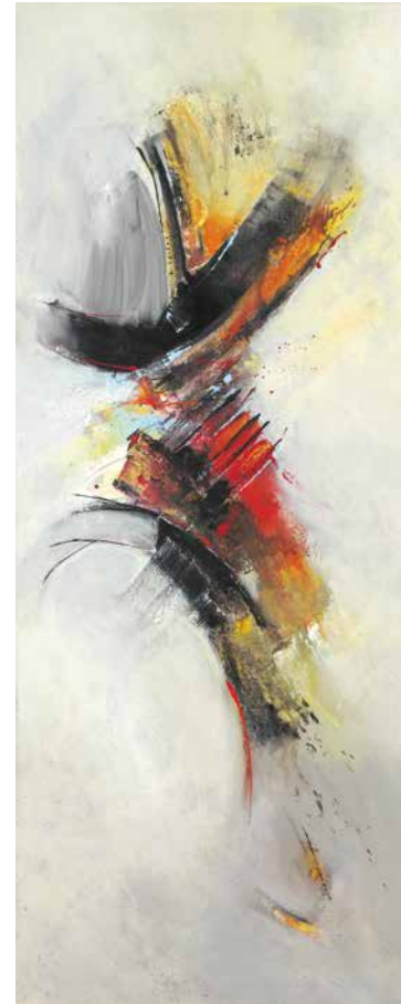
Sailing Home acrylic on jute 2018, 200 x 80,5 cm center left: signed and dated