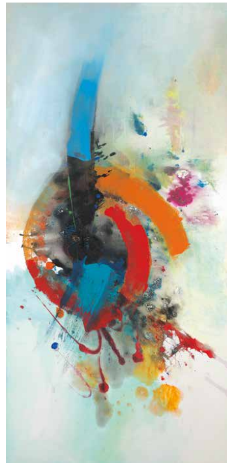
Musical Harmony acrylic on canvas 2019, 200 x 98 cm center: signed and dated