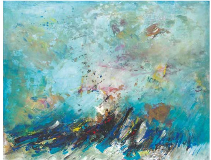
Ocean acrylic on canvas 2018, 100 x 130 cm bottom left: signed and dated