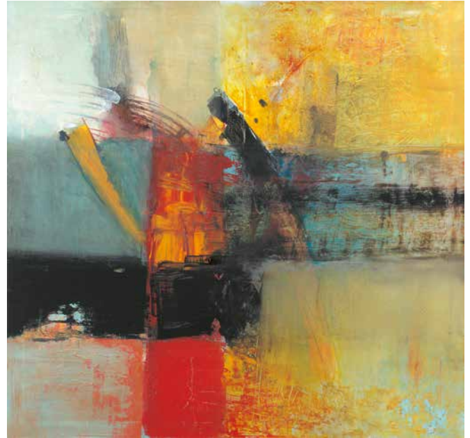
Red and Black Stripes acrylic on canvas 2015, 100 x 105 cm center: signed and dated