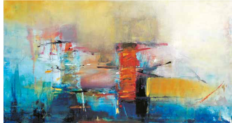
South City acrylic on canvas 2015, 70 x 130 cm bottom right: signed and dated