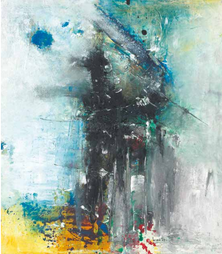
Waterfall acrylic on canvas 2015, 80 x 70 cm bottom right: signed and dated