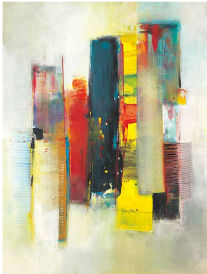
Downtown acrylic on canvas 2018, 122 x 92,5 cm bottom right: signed and dated