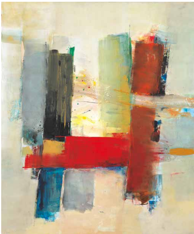
Bridge acrylic on canvas 2018, 120 x 100 cm bottom center: signed and dated