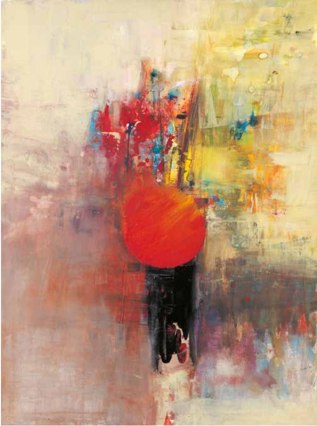
Sunrise acrylic on canvas 2019, 120 x 90 cm bottom center: signed and dated