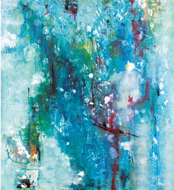
Colours of Sea acrylic on canvas 2015, 115 x 105 cm bottom center: signed and dated