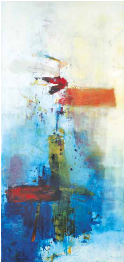
California Dreamin acrylic on canvas 2015, 150 x 70 cm bottom center: signed and dated