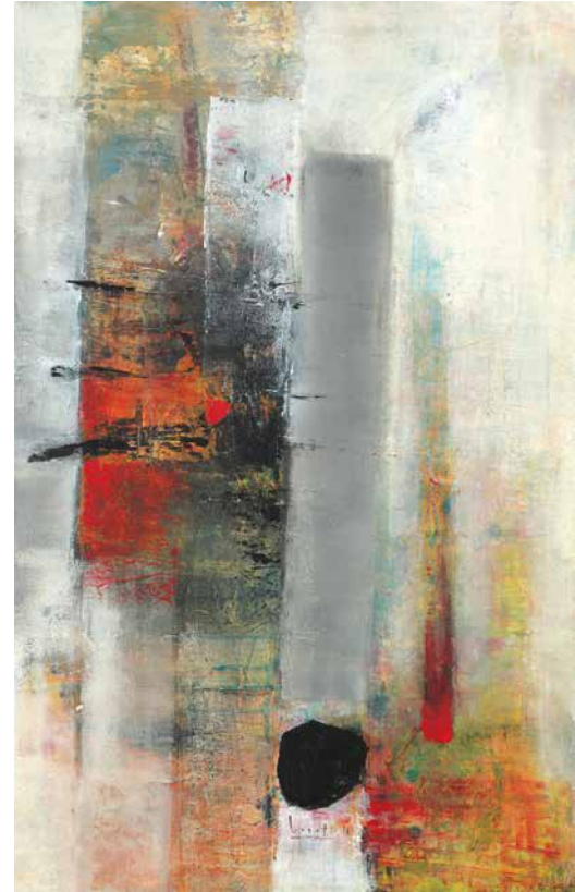
Black Point acrylic on canvas 2016, 110 x 70 cm bottom center: signed and dated