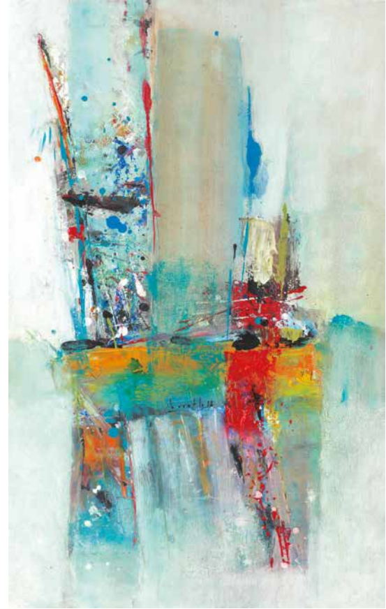
I'm Sailing acrylic on canvas 2018, 80 x 50 cm bottom center: signed and dated