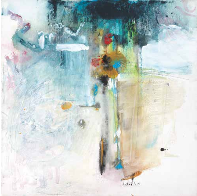
Before the Rain acrylic on canvas 2015, 50 x 50 cm bottom right: signed and dated