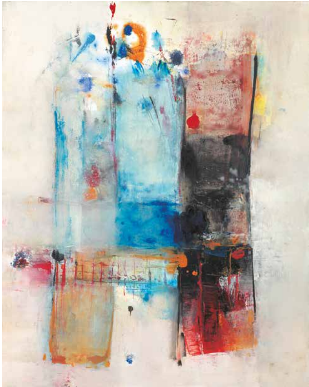
Long Island acrylic on canvas 2018, 100 x 80 cm bottom center: signed and dated