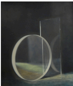
Ingar Krauss · o. T. (aus der Serie GLAS) · 2014/15 Bromsilberpapier, Ölfarbe · 50 x 42 cm

For each photo, the following applies - the light must, in some way, penetrate glass, bundled and scattered. Ingar Krauss directs light onto and through the glass, making it the subject of his photographs in the series thus named.