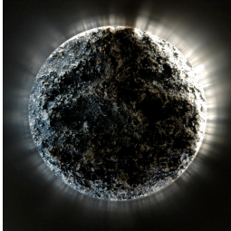
Kurt Buchwald · Objekt 712 · 2006 C-Print · 40 x 40 cm

"Montiertes Licht" (Mounted Light) shows four positions for the examination of light as the medium of photography. The objects and spaces are only in the foreground in the first moment of observation. The second view tries to question the perception, to follow the traces of light.